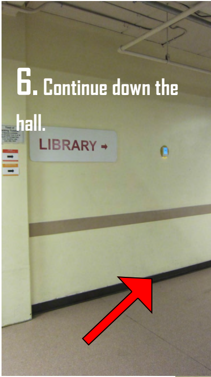
6. Continue down the hall.