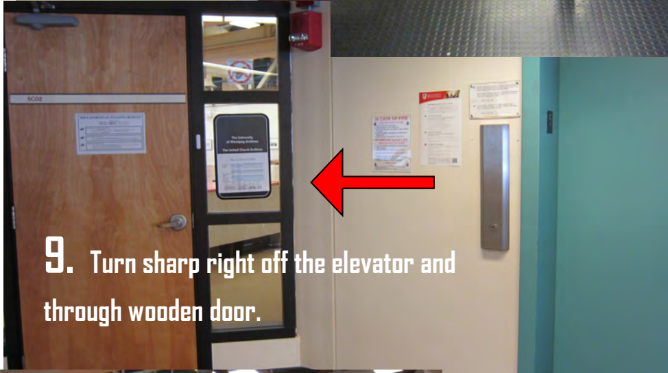
9. Turn sharp right off the elevator and through wooden door.