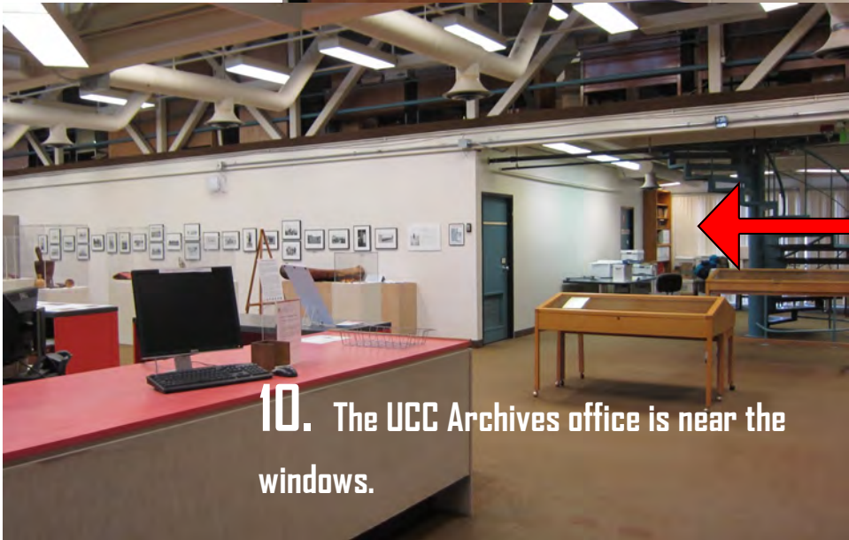
10. The UCC Archives office is near the windows.