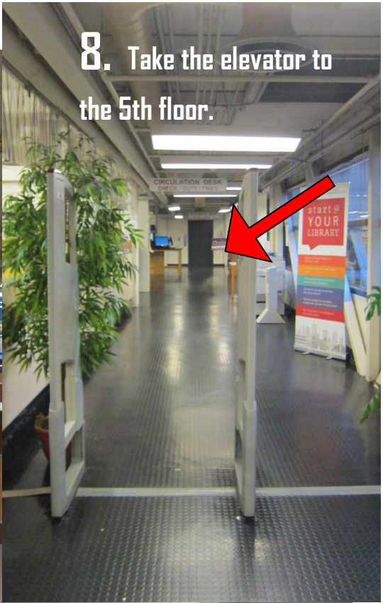
8. Take the elevator to the 5th floor.